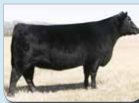
Dam of Complement